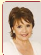
Dana Rosemary Scallon Irish singer and former Member of the European Parliament