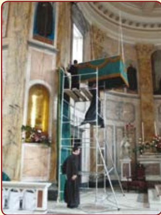
Installation of the throne

PONTIFICAL MASS BY HIS EMINENCE CARDINAL BURKE