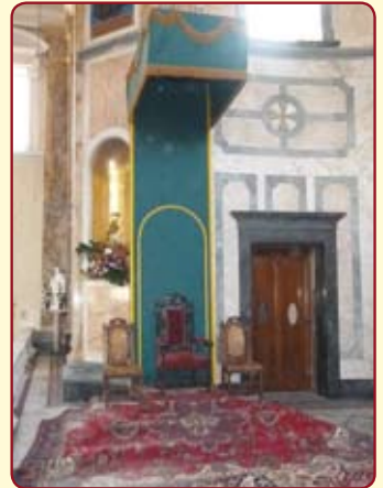
A throne is now ready to receive His Eminence

Please contact us, we would appreciate your help!